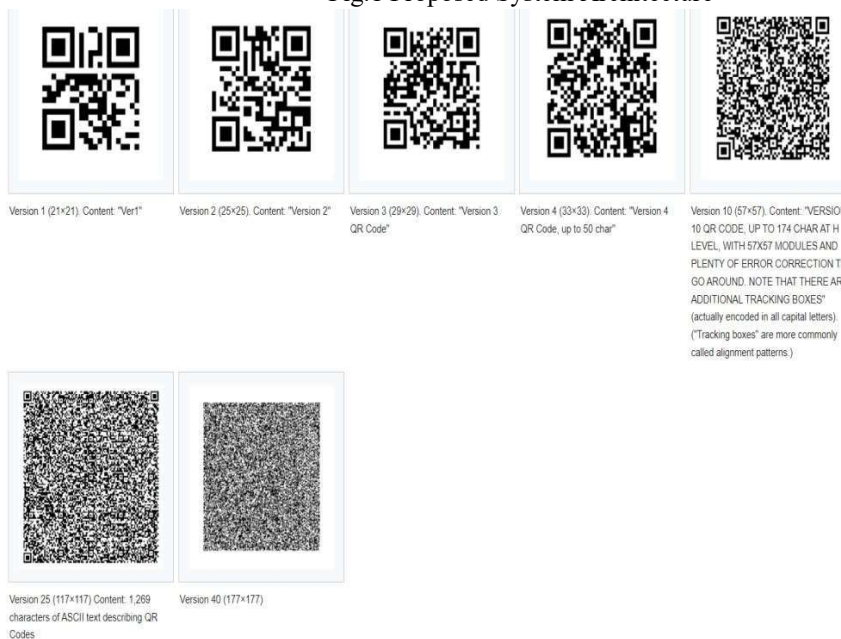
Fig.2 Different QR codes

Two-dimensional (2D) matrix codes are a way how to efficiently store data that are machine readable. Thanks to the great spread of smartphones, 2D matrix codes have found application in many areas of life and industry. QR (quick response) Code was invented in 1994 by Denso Wave for the automotive industry in Japan, but nowadays has much wider usage. They are widely used in segments such as manufacturing, logistics, sales, media, advertising, tourism, e-commerce, identification, and authentication [1,2]. The QR Code often contains additional information about the product, the object or the place where it is located. However, they can also be a URL to a web page, Global Positioning System (GPS) coordinates, contact details, delivery address, payment instructions, etc. QR codes belong to a group of 2D matrix codes (similarly the data matrix codes). Traditional QR code (QR code Model 1 and Model 2) has a square shape and on its three corners are typical square patterns—finder patterns (FP), which are used to locate the code and to determine its dimensions and rotation.